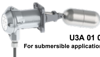
U3A 01 04 For submersible applications