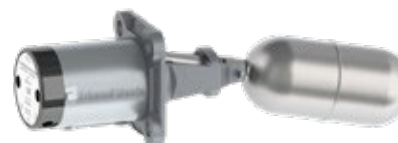
P 01 04 For pneumatic control applications