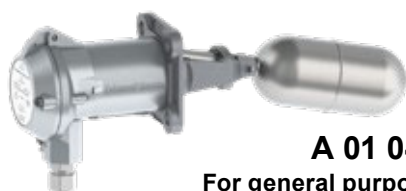
A 01 041 For general purpose