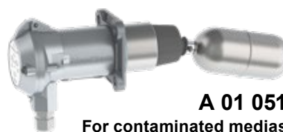
A 01 051 For contaminated medias