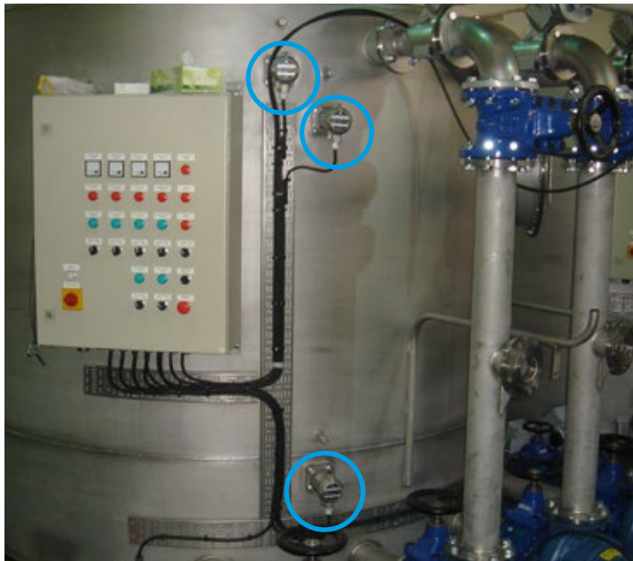
Level switch type: A 01 051E15